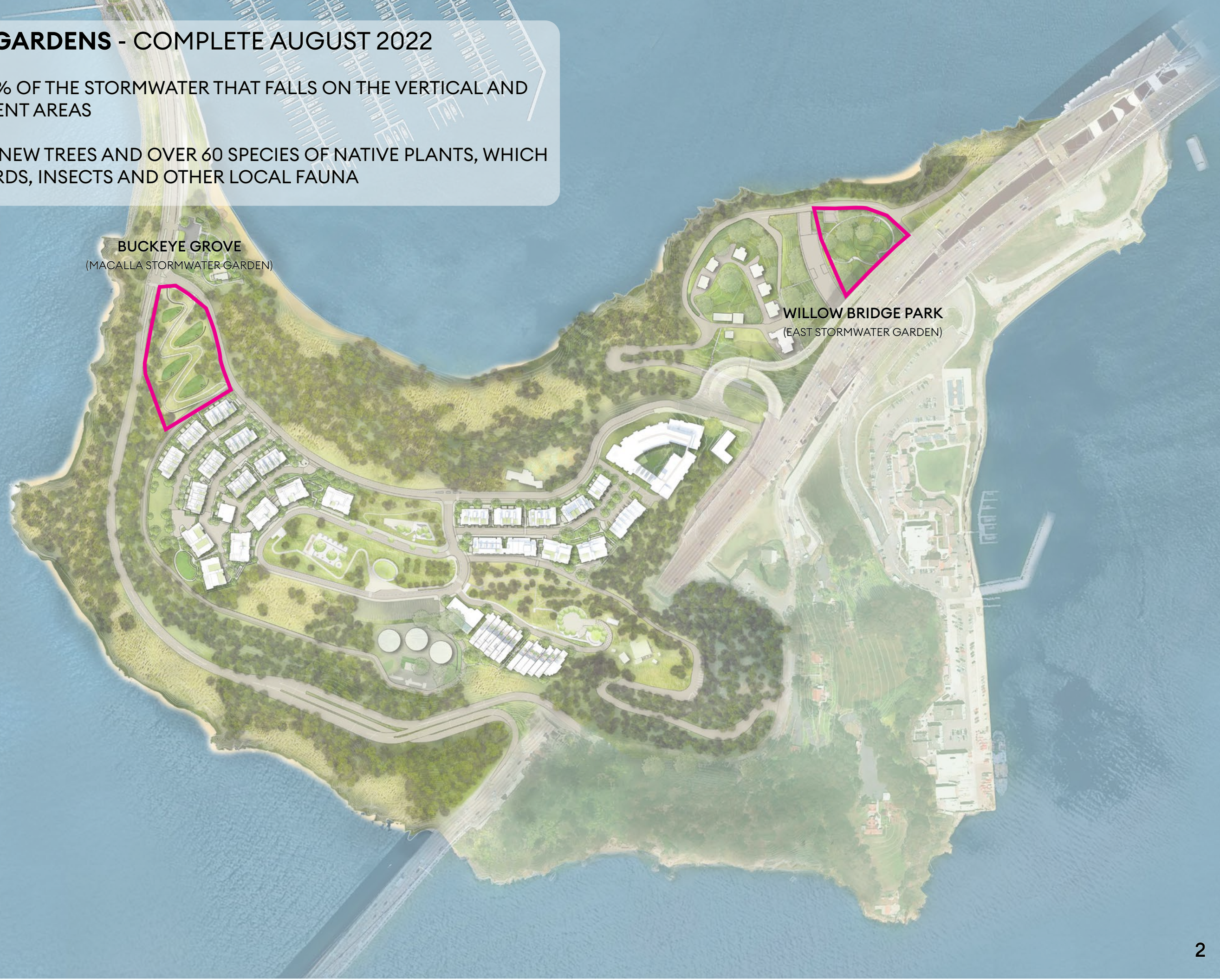
BUCKEYE GROVE (MACALLA STORMWATER GARDEN)

PLANTING INCLUDES 195 NEW TREES AND OVER 60 SPECIES OF NATIVE PLANTS, WHICH PROVIDE HABITAT FOR BIRDS, INSECTS AND OTHER LOCAL FAUNA