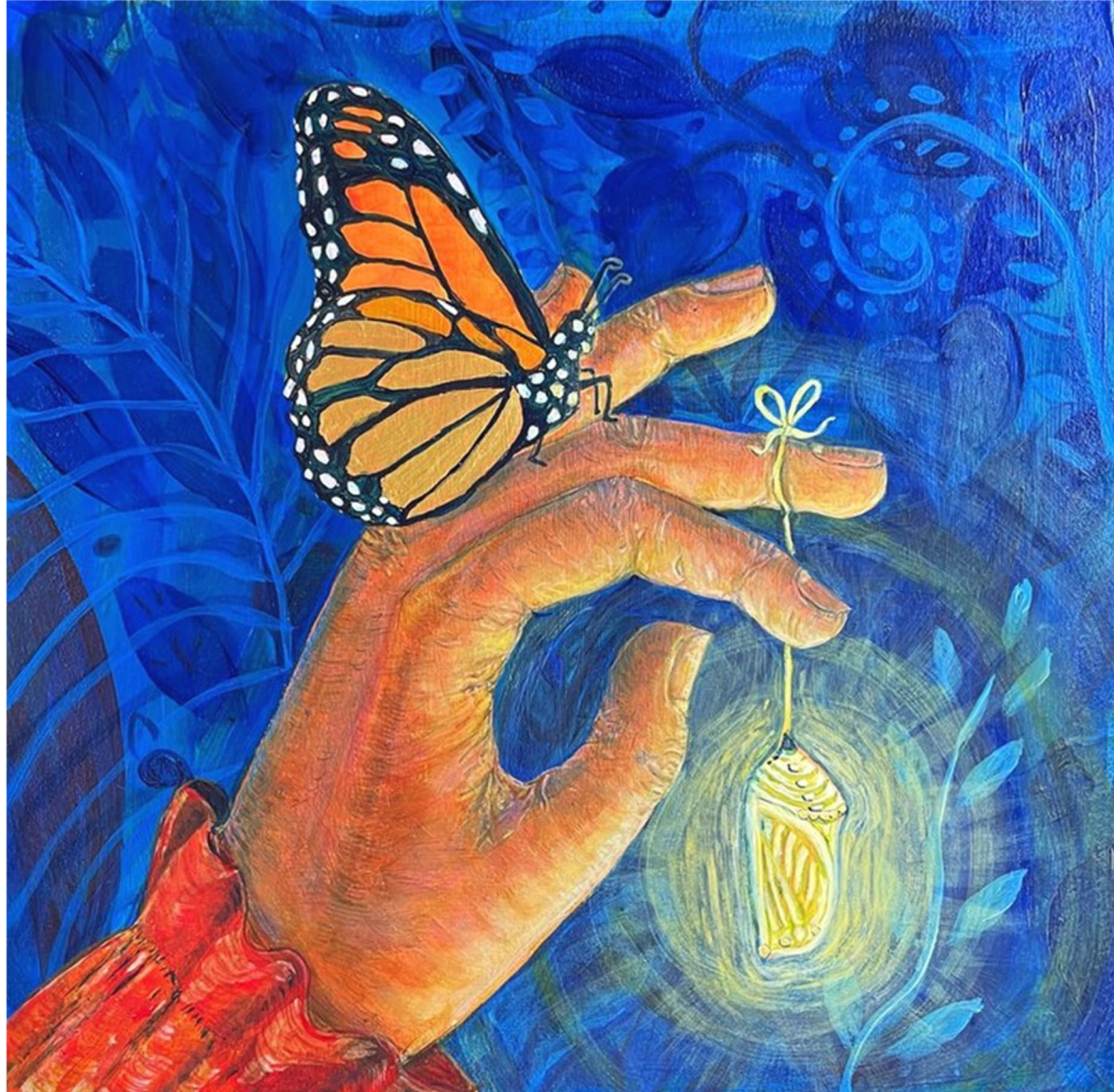
Belen Islas, Light It Up (2022), Acrylic on Paper.