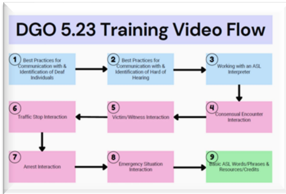
Training Video for SFPD Academy