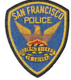
WILLIAM SCOTT CHIEF OF POLICE

There were 252 hits returned and analyzed; Seven were determined to be potentially biased and are still currently under investigation.