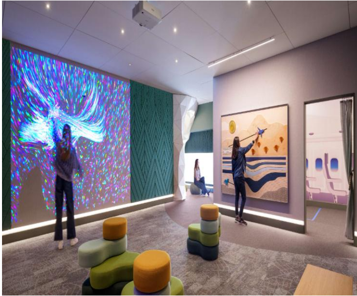
Travelers in Sensory Room playing with interactive graphic and video screen.