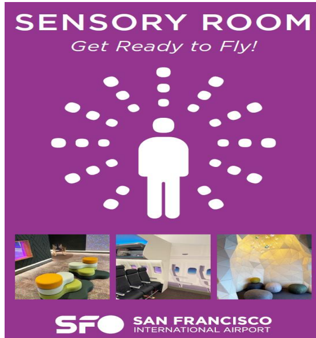
Purple flyer with the words, “Sensory Room” Get Ready to Fly! , and a figure of a man radiating. Small photos of room interior and SFO logo at the bottom.