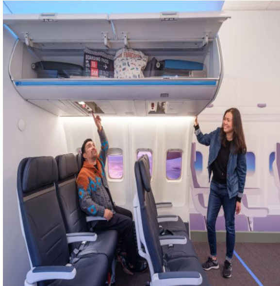
Travelers in the airplane interior mock-up using the seating, cabin lighting Controls, overhead compartments and windows.