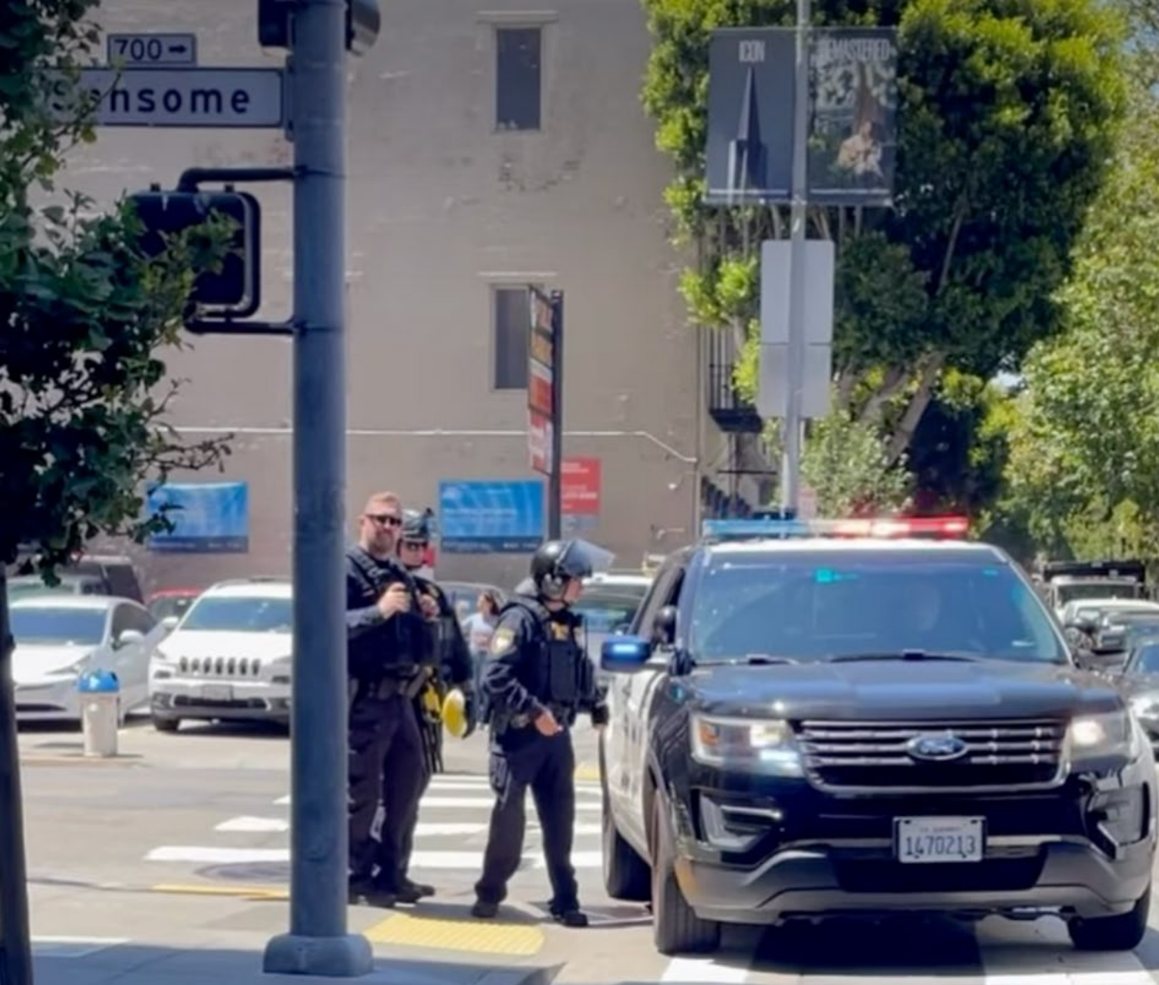
Tuesday, June 29 100 Montgomery to 630 Sansome San Francisco ICE/EPS/SEPD