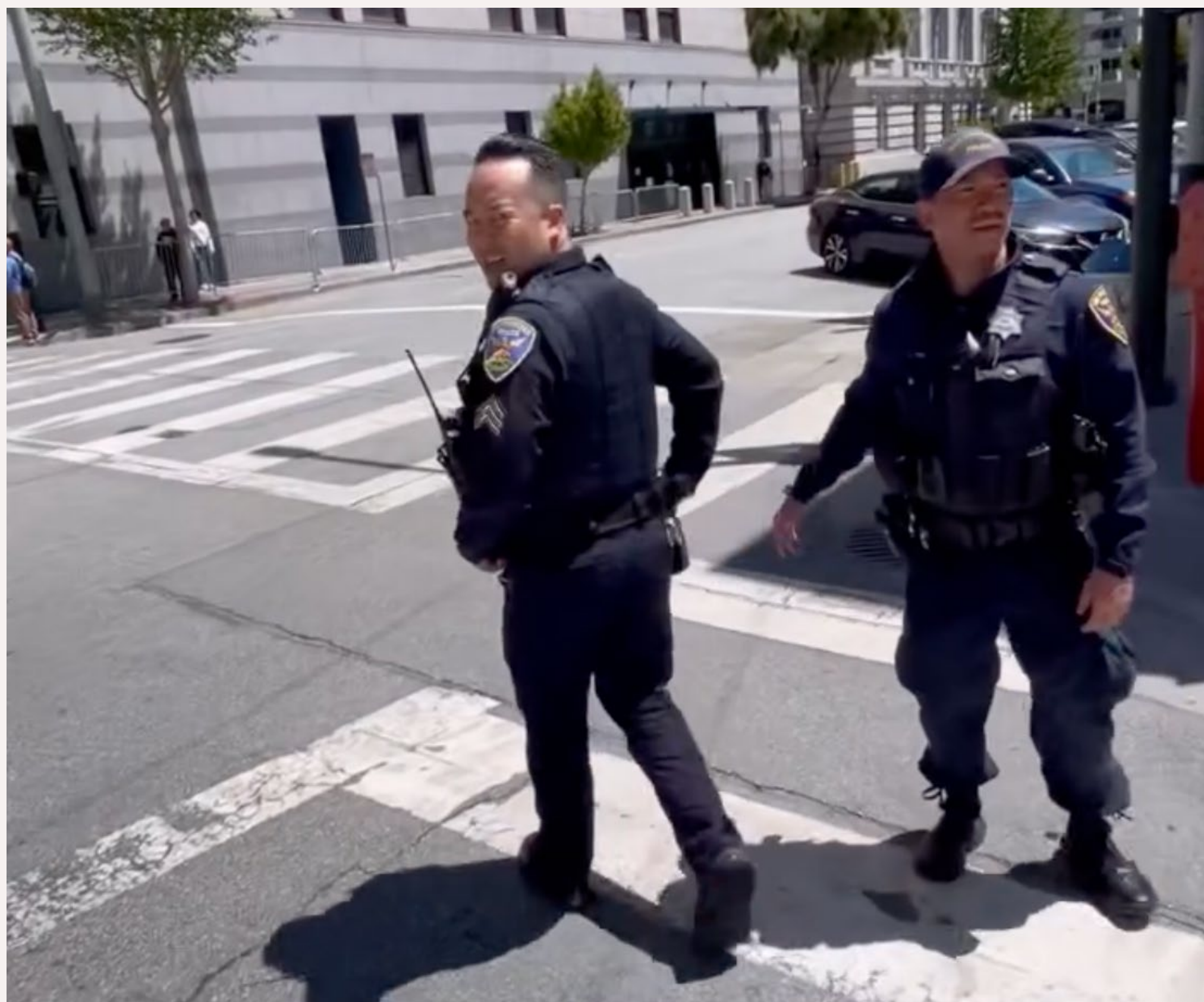
July, 8, 2025 630 Sansome