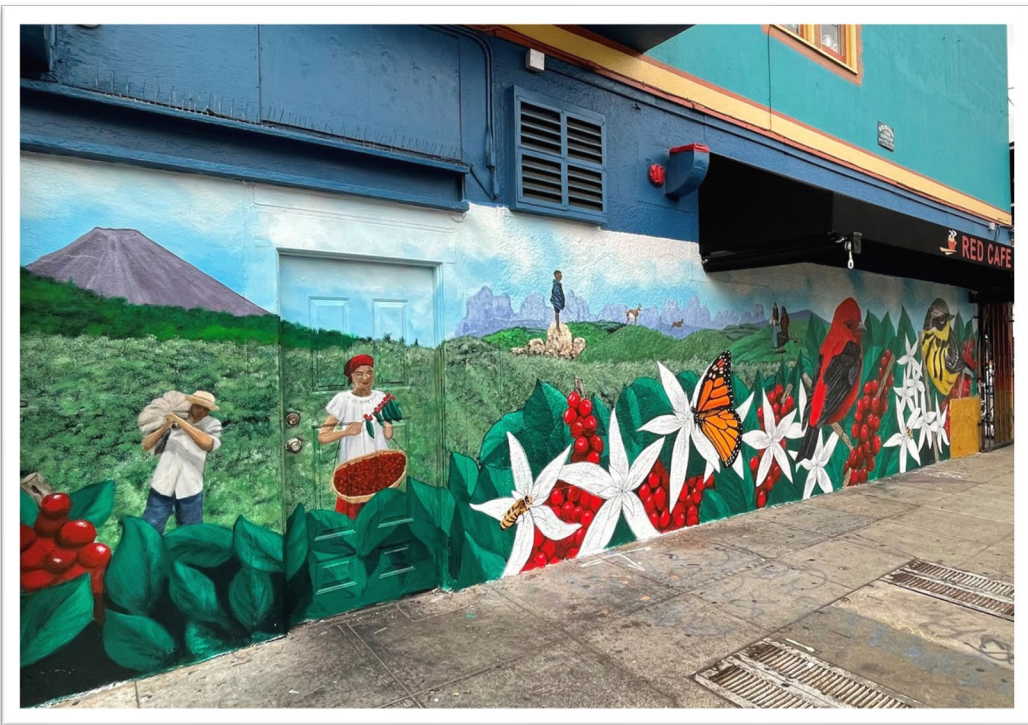
Claudio Talavera-Ballon, Guardianes del Café , 2021, Acrylic.