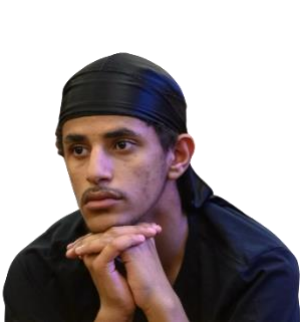
Children & Youth Are Ready to Learn & Succeed In School

The CNA will be organized around the following four Result Areas: