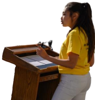
Youth Are Ready For College, Work & Productive Adulthood