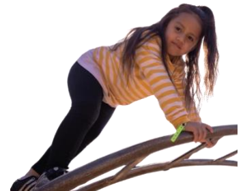
Children & Youth Are Physically & Emotionally Healthy

Taken together, these Result Areas represent the conditions within individuals, families, and communities that are necessary to support positive outcomes over the life course. DCYF’s current funding framework is also organized around these Results Areas, allowing the CNA to both track progress and identify emerging needs, gaps and experiences that may require new or refined approaches.