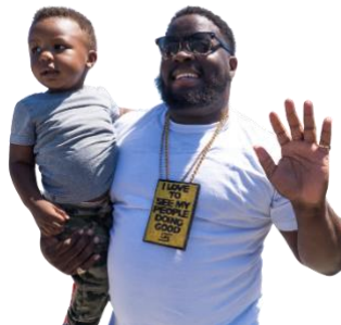
Children & Youth Are Supported by Nurturing Families & Communities