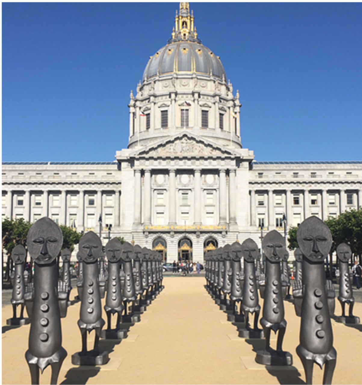
Zak Ové., Invisible Man and the Masque of Blackness , Civic Center Plaza (2018).