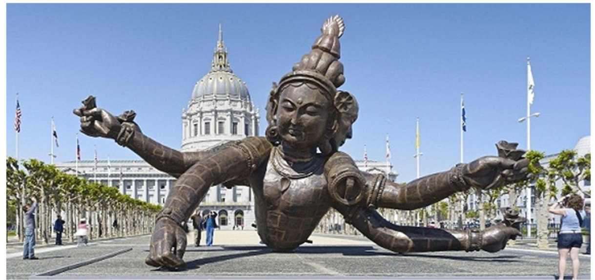
BOTTOM: Zhang Huang, Three Heads Six Arms , Civic Center Plaza (2010)