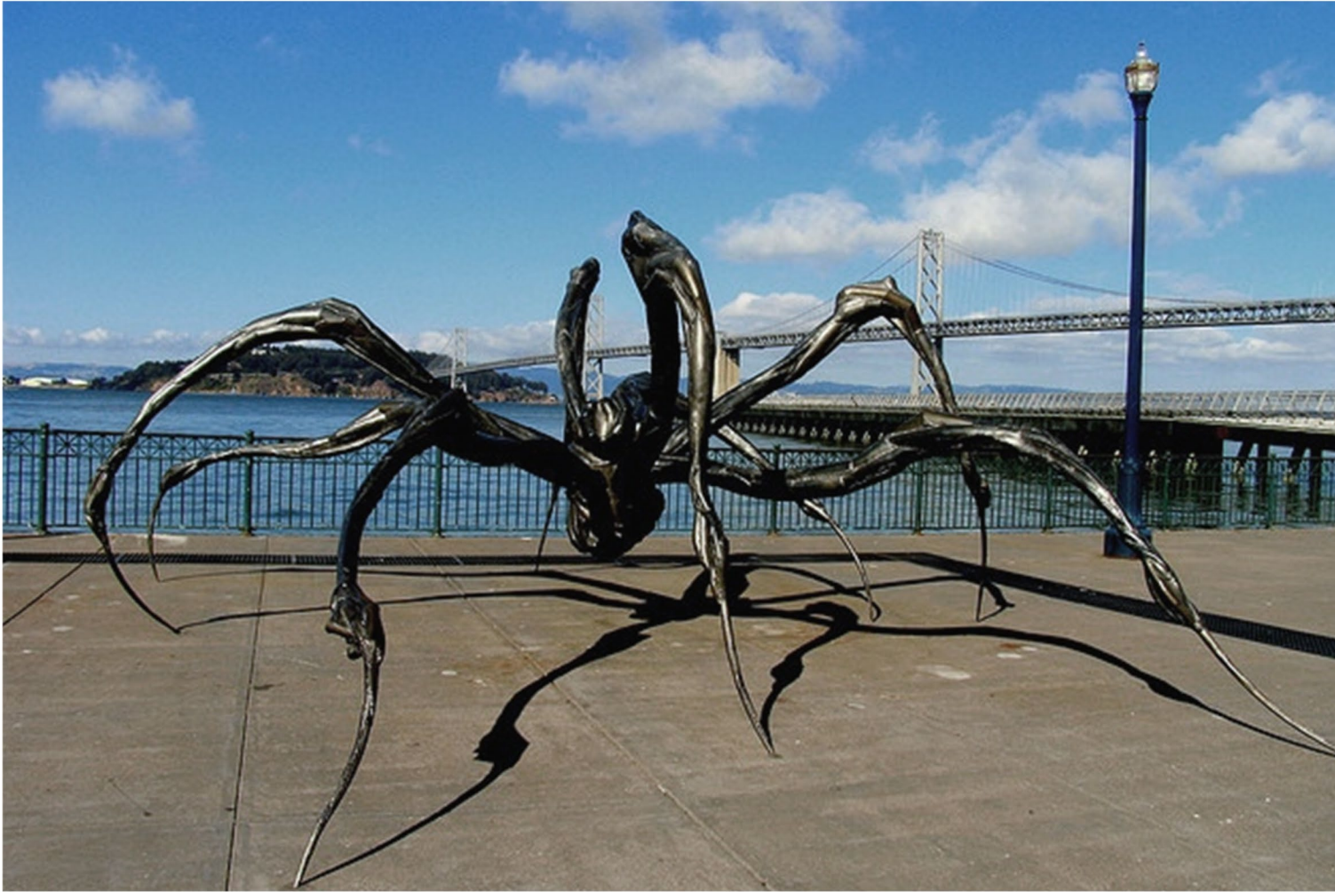
Louise Bourgeois., Crouching Spider , Embarcadero (2007).