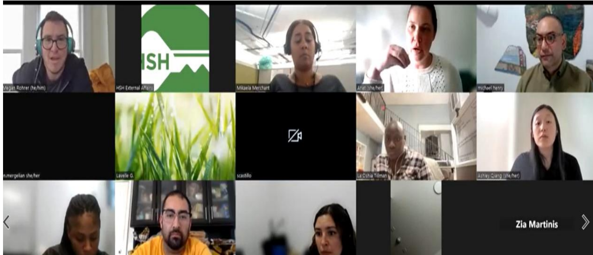
Picture taken from LHCB-CE public meeting