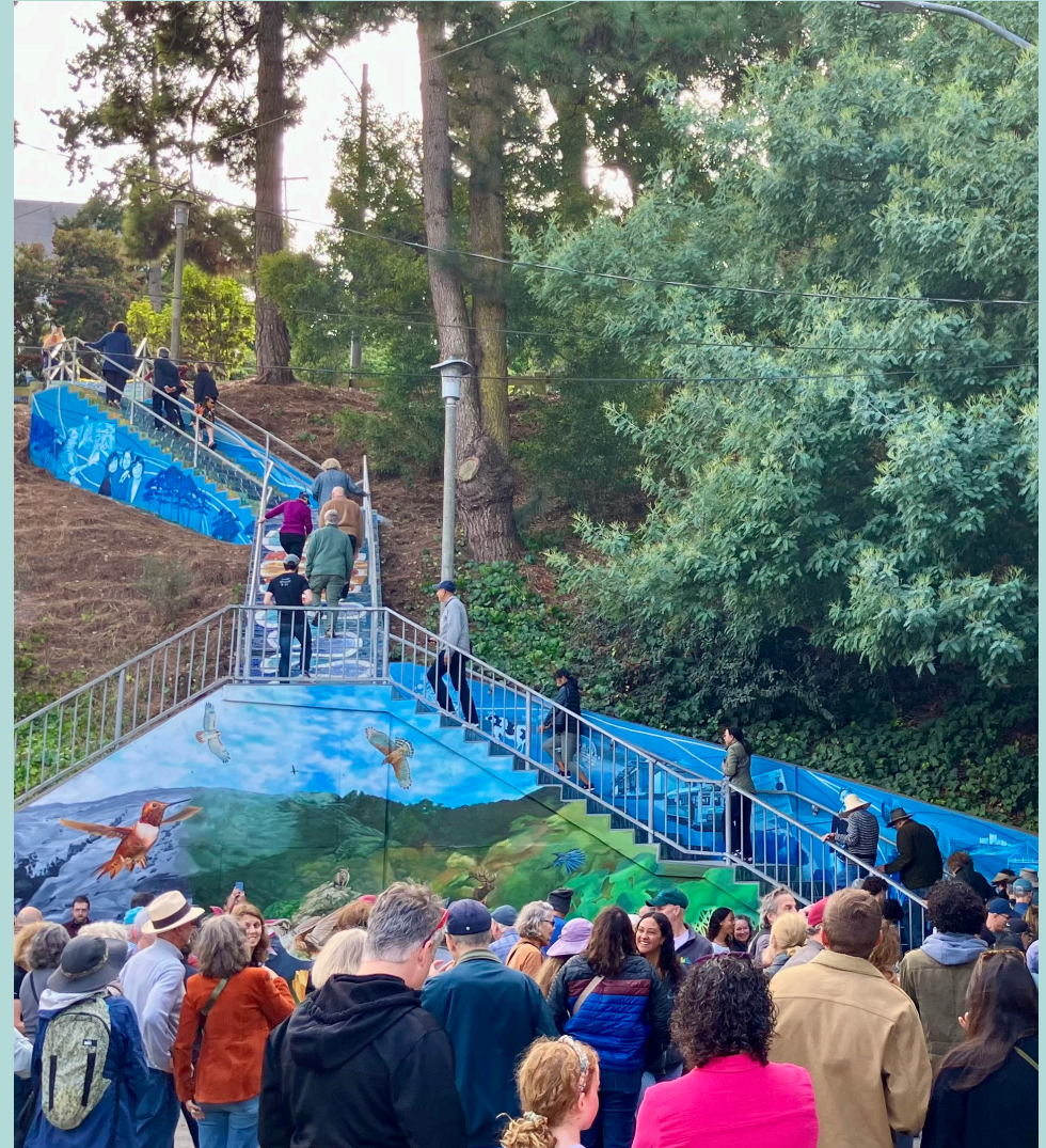
Burnside+ Mural and Tiled Staircase

We recognize our communities' interdependence and collective strength and fund neighborhood beautification projects that foster resilience, safety, and belonging in San Francisco.