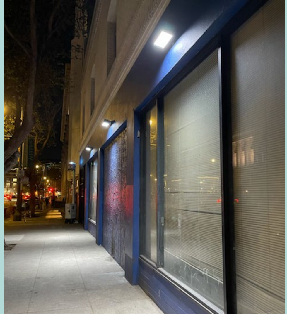
Lighting safety project in Civic Center