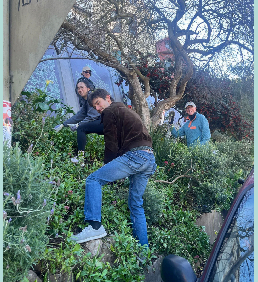
Virginia Garden Walk and Mural