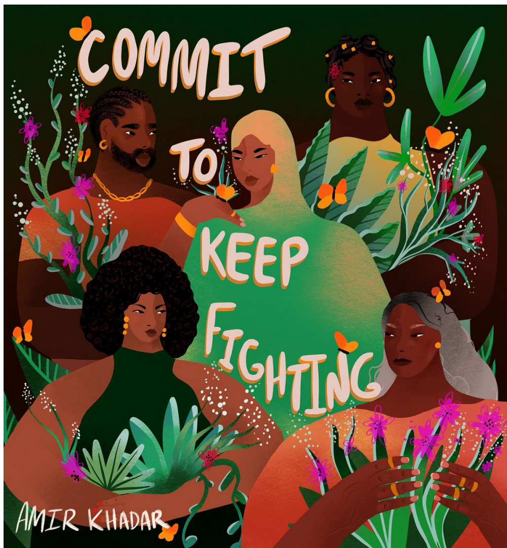
Commit to Keep Fighting , 2021, digital illustration