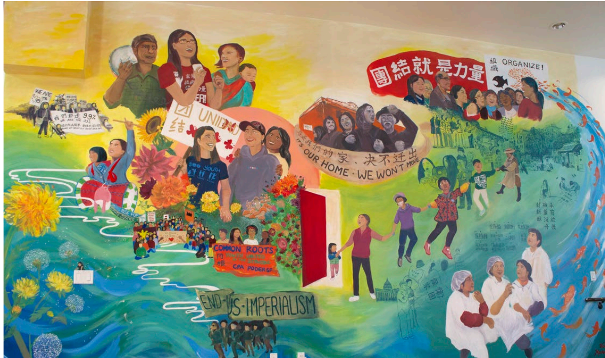
CPA History Mural, 2024, acrylic