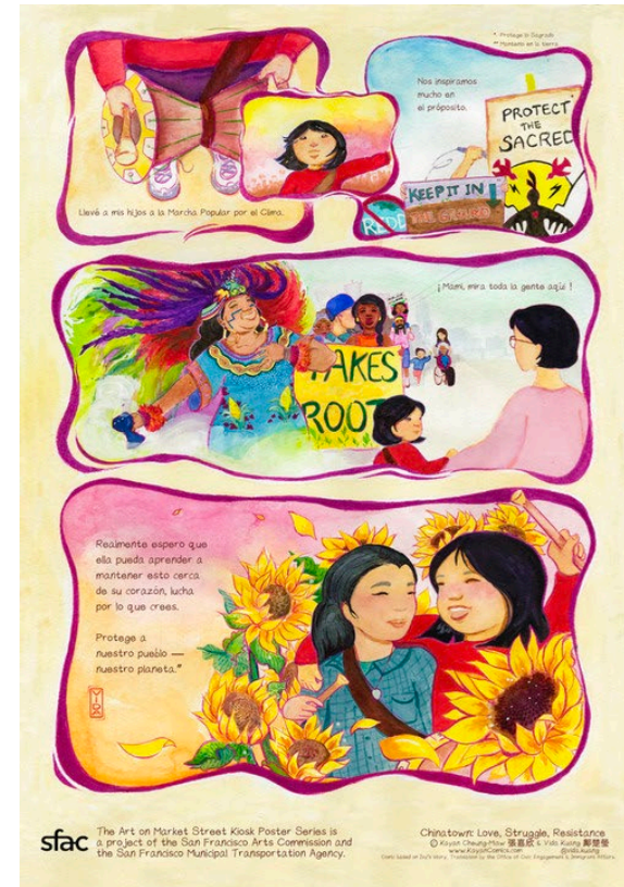
Chinatown Love Struggle Resistance 1, 2022, watercolor