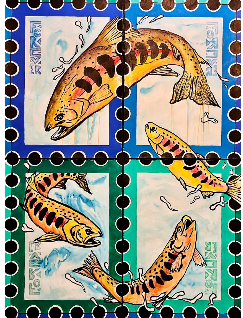
Forever Golden Trout , 2025, watercolor, ink, and acrylic