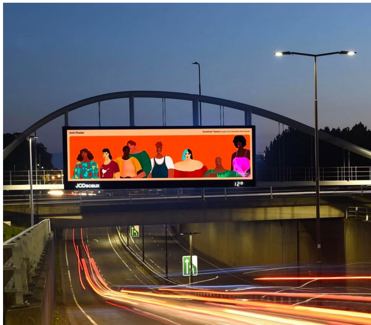
Searching... , 2022, digital illustration