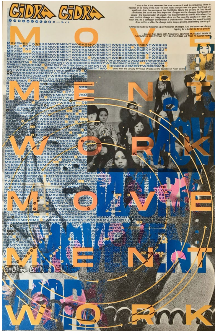
Movement Works, 2021, risograph