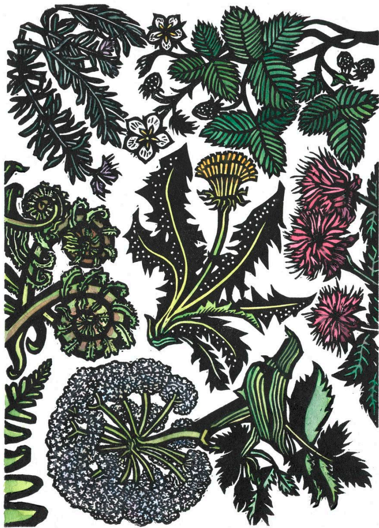
Heirloom Garden , 2020, linoleum block print and watercolors