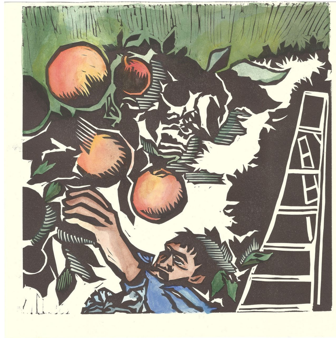
Peach Picker , 2014, linoleum block print and watercolors