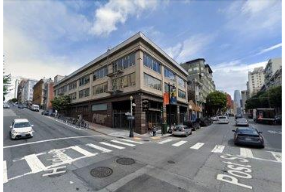
888 Post – TAY Navigation Center