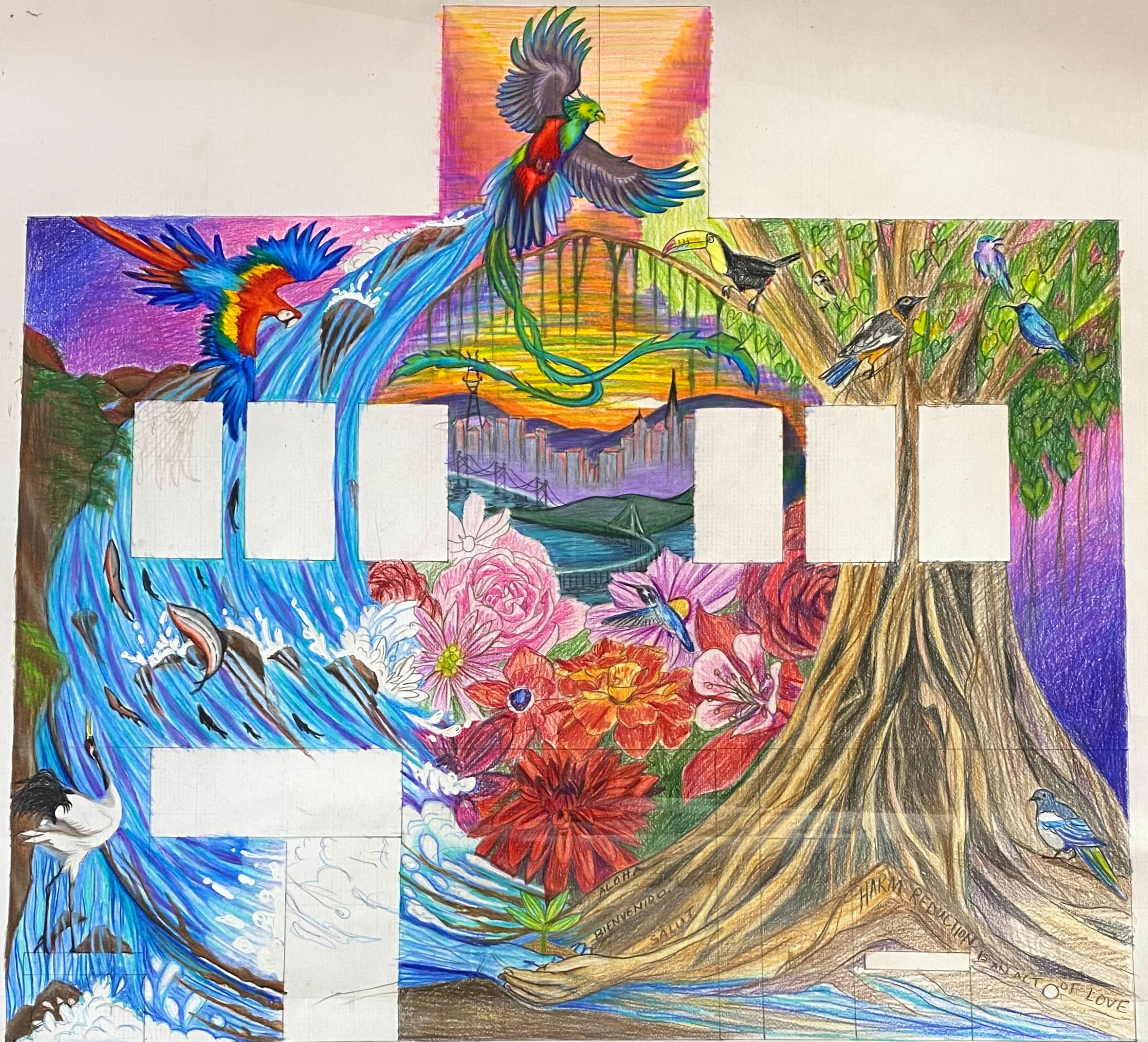
SF CITY CLINIC MURAL PROJECT 1/2 inch = 1 ft+ © 2022 Precita Eyes Muralists Elaine Chu + Safi Kolozsvari