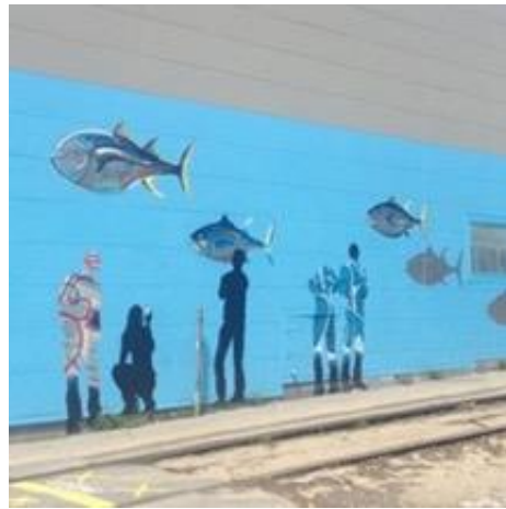
Ocean Avenue Mural Project in partnership with SFMTA Railway.