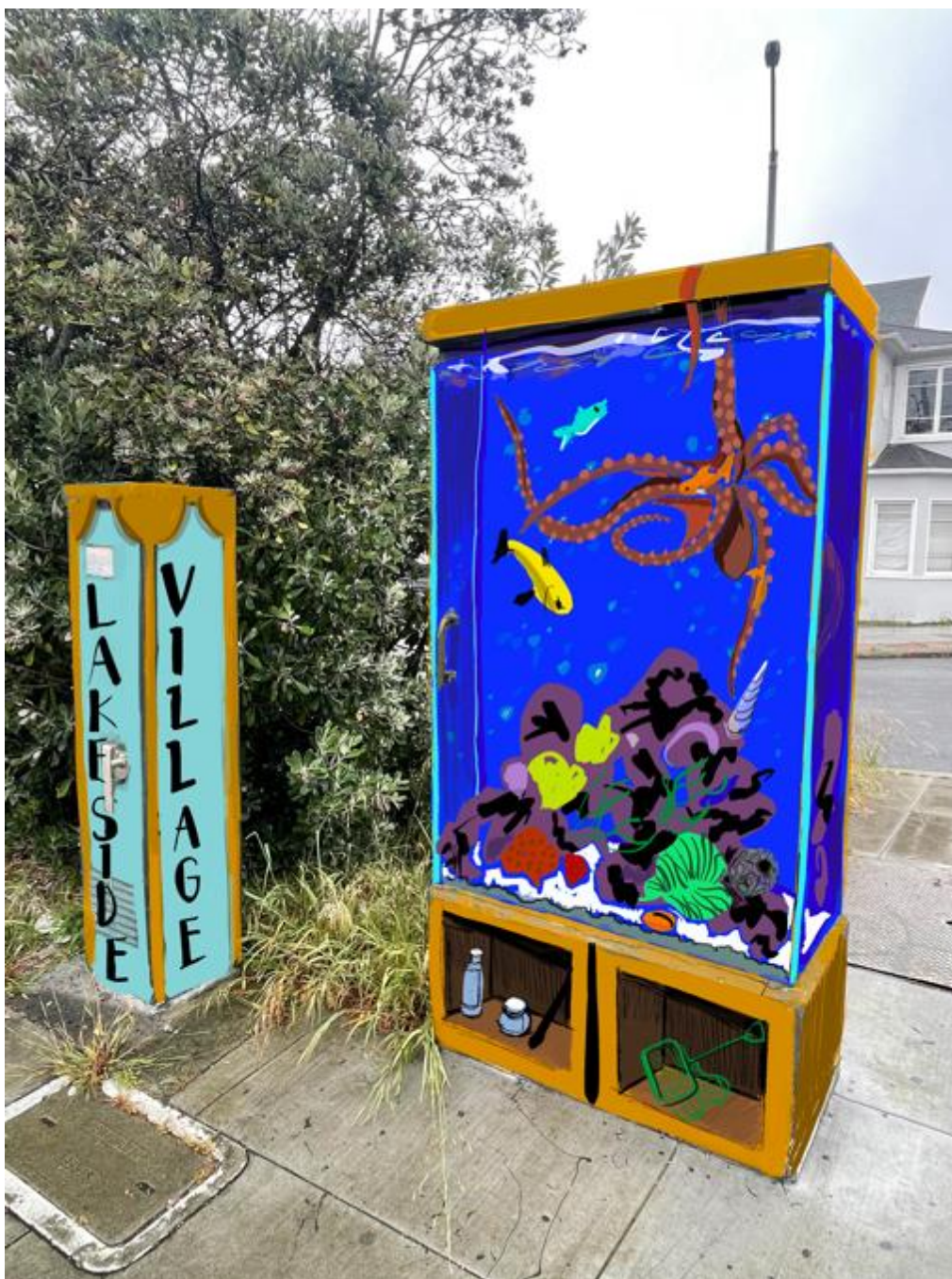
Attachment 8: Color image(s) of design "Saltwater Fishtank"