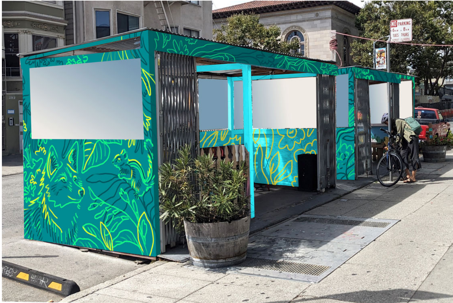
Beloved Parklet Mural "Beloved Garden" Sidewalk view