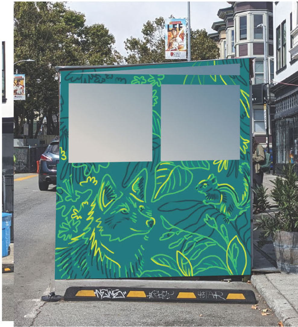
Beloved Parklet Mural "Beloved Garden" Outer-end panels, sidewalk view