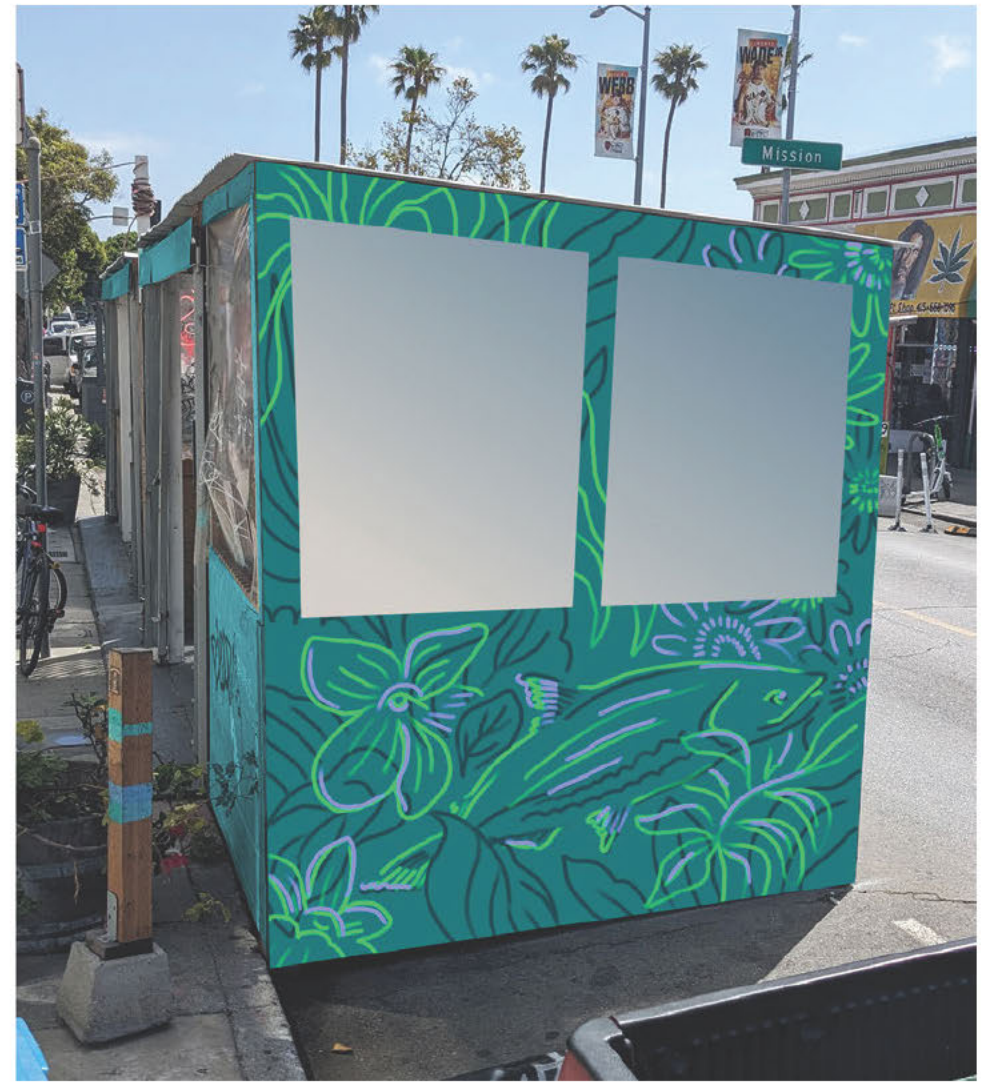
Kseniya Makarova / September 2024