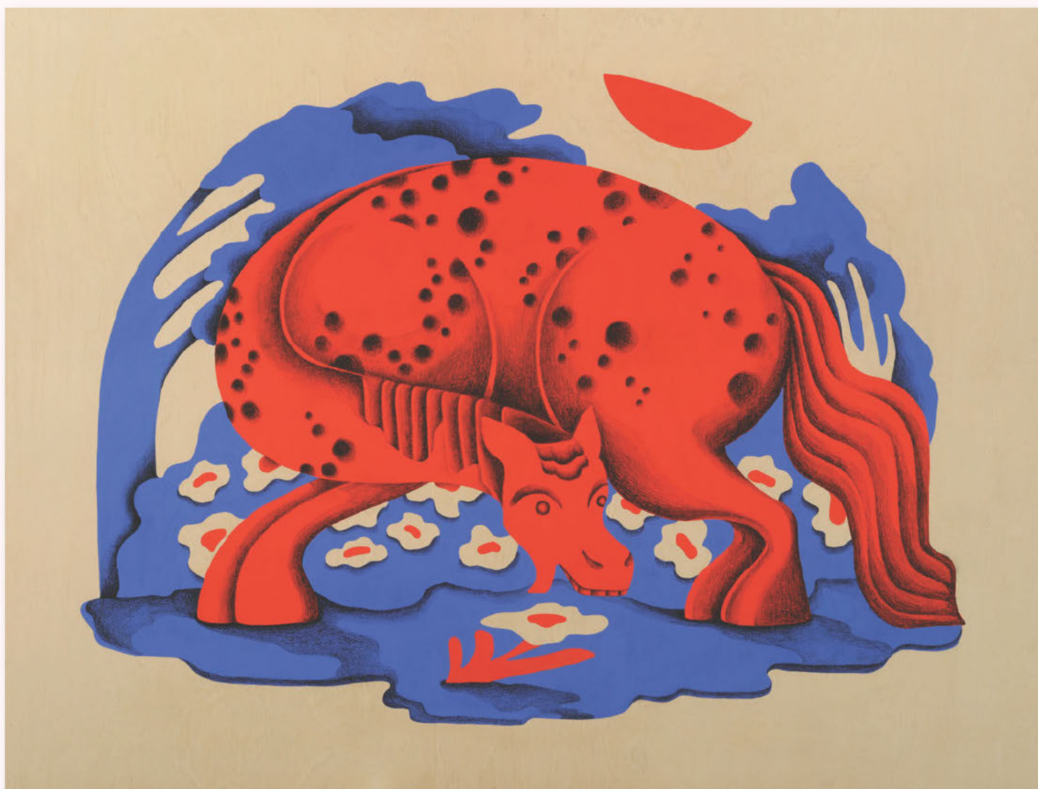
TITLE, YEAR: RED HORSE (TREAT), 2023 ; exhibited in the 2023 de Young Open MEDIUM: ACRYLAGOUACHE + WAX PENCIL ON WOOD PANEL SIZE: 40" x 30"