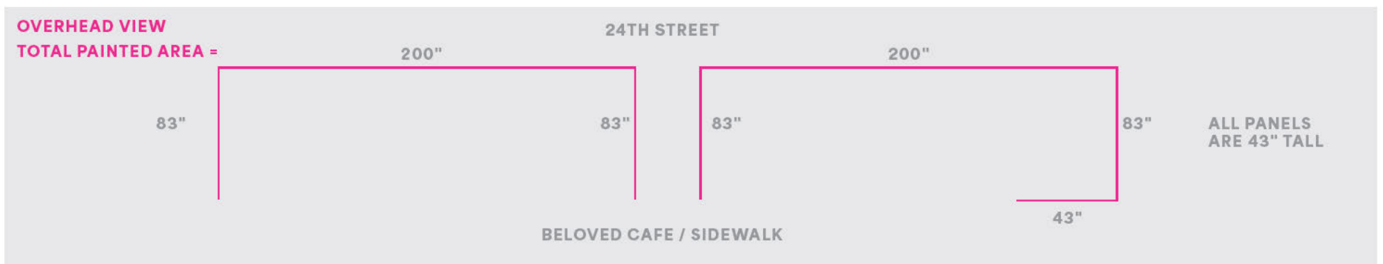
Beloved Cafe Parklet Mural Location + Measurements