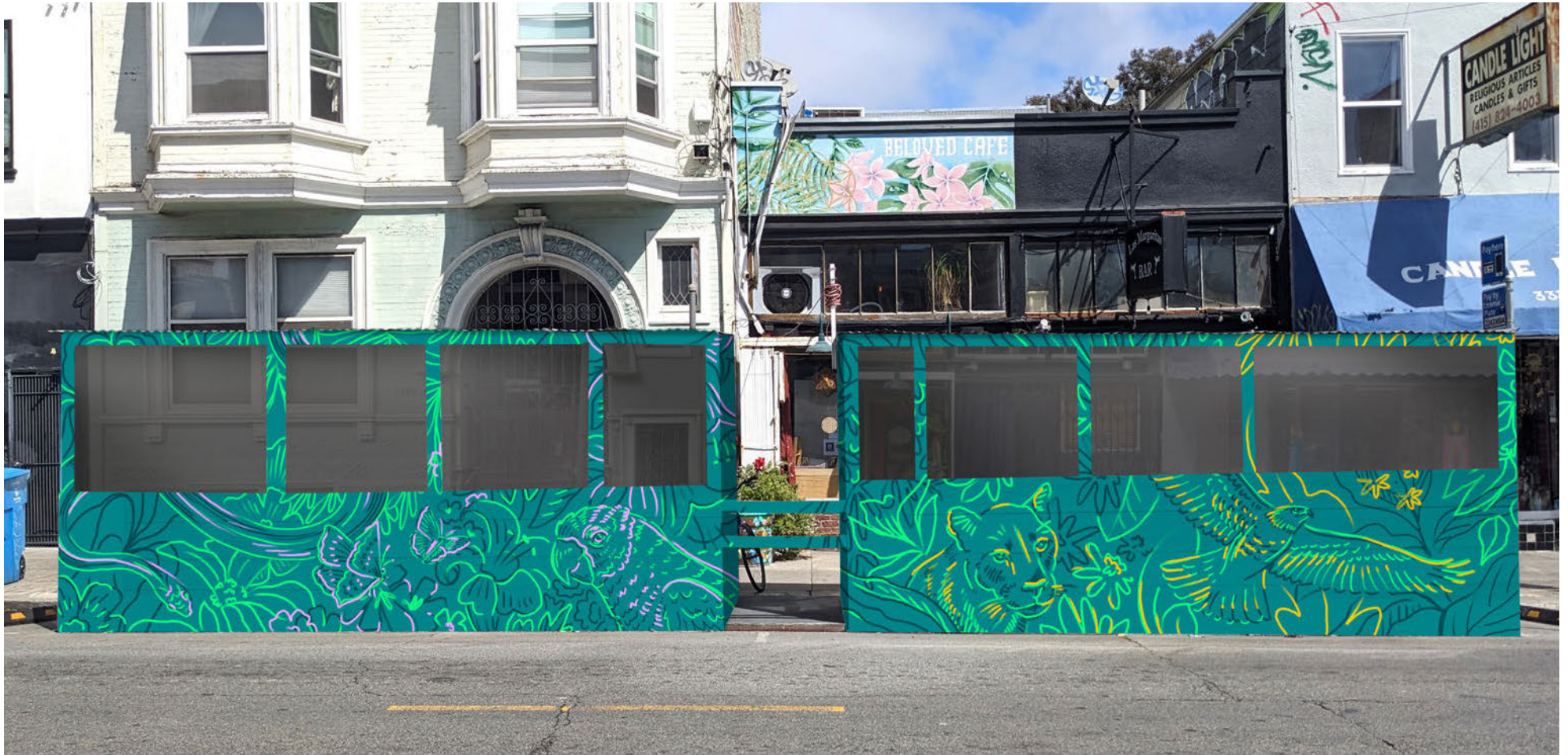
Beloved Parklet Mural "Beloved Garden" Street-side View