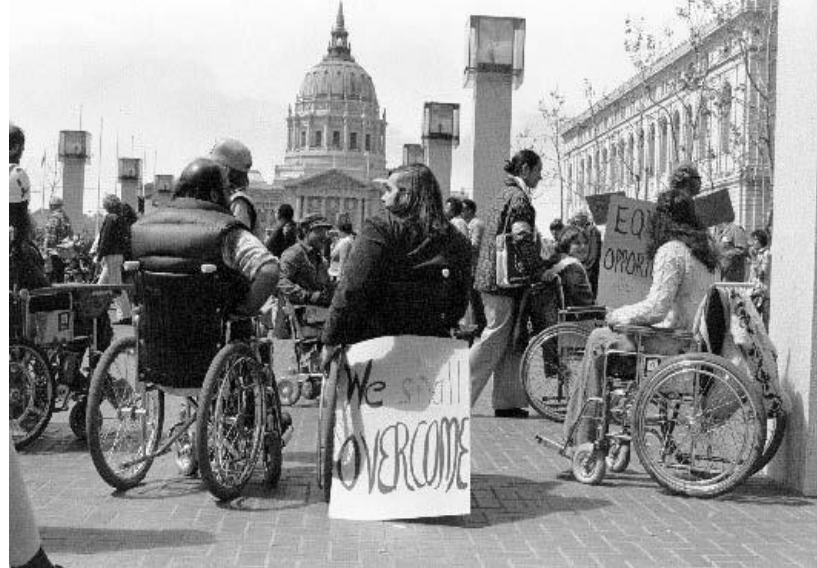
Image: Wheelchair users protesting outside of San Francisco City Hall in 1977. One protester has a hand-made “We Shall Overcome” sign on the back of his wheelchair (black and white.)