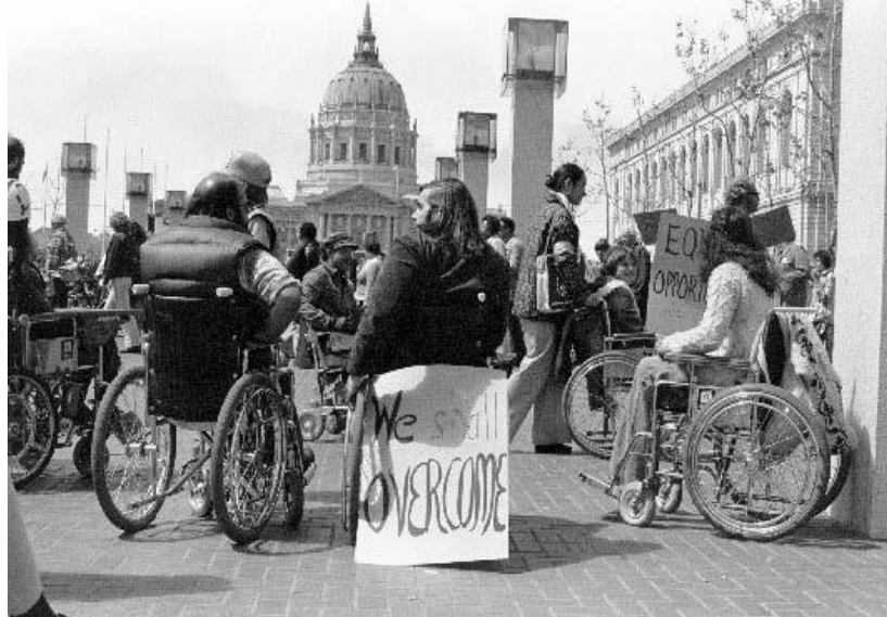
Image: Wheelchair users protesting outside of San Francisco City Hall in 1977. One protester has a hand-made “We Shall Overcome” sign on the back of his wheelchair (black and white.)