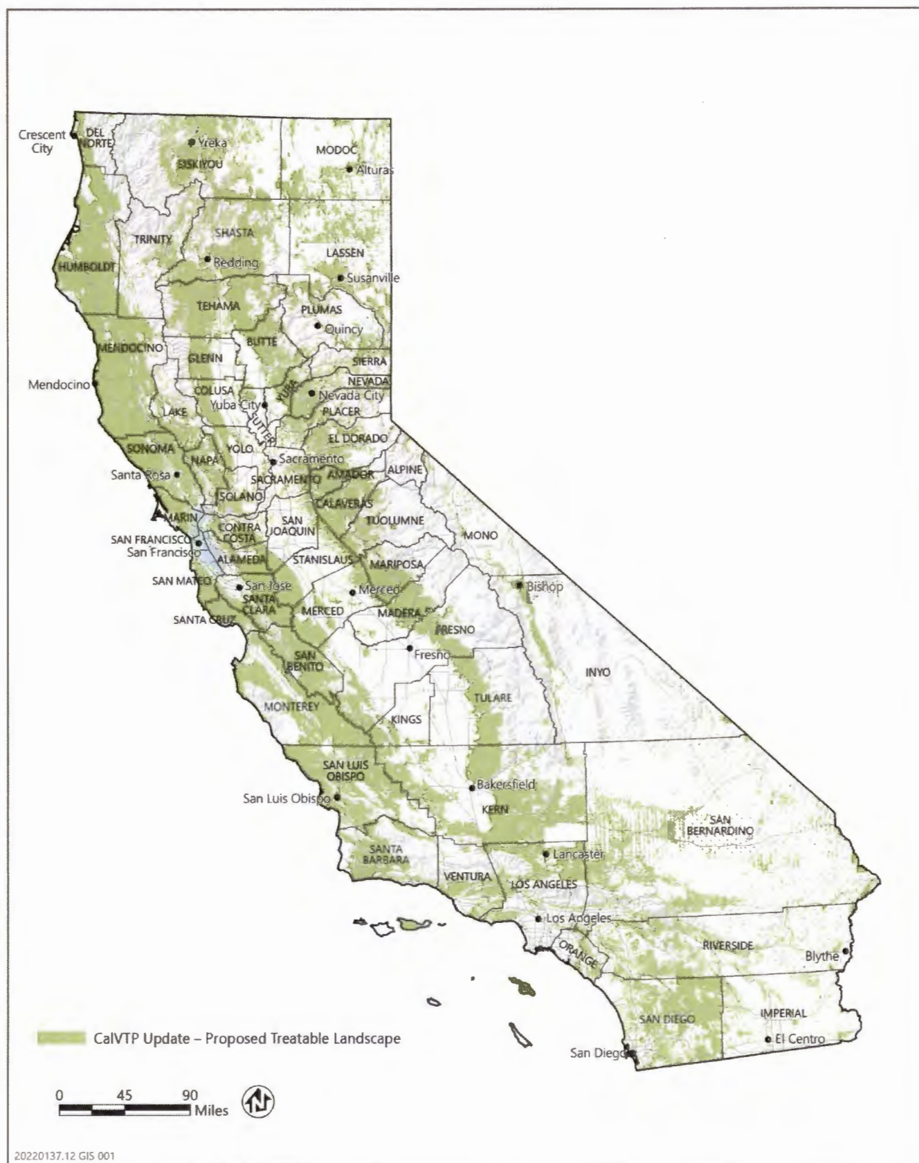
Figure 1 Proposed Treatable Landscape for the CalVTP Update Subsequent Program EIR