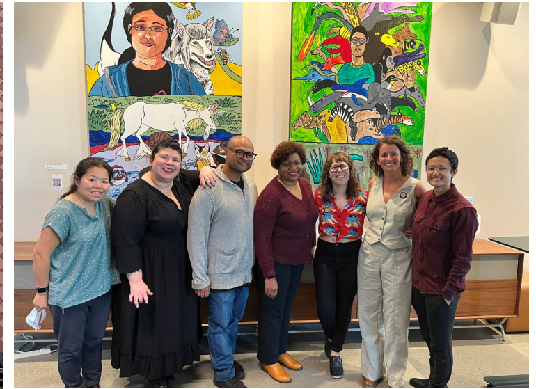
Fri 9/19/25 | SF Disability Cultural Center Info Session