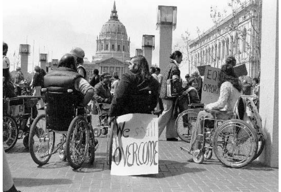
Image: Wheelchair users protesting outside of San Francisco City Hall in 1977. One protester has a hand-made “We Shall Overcome” sign on the back of his wheelchair (black and white.)