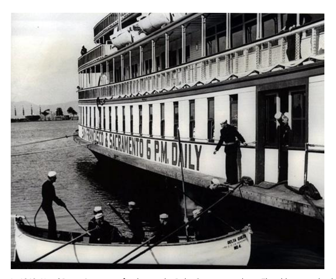
In 1940, Naval Reservists report for duty to the Delta Queen steamboat. The old steam wheeler was used by the Navy as a training and barrack facility at Yerba Buena Island and Treasure Island in San Francisco Bay between 1940 and 1946.