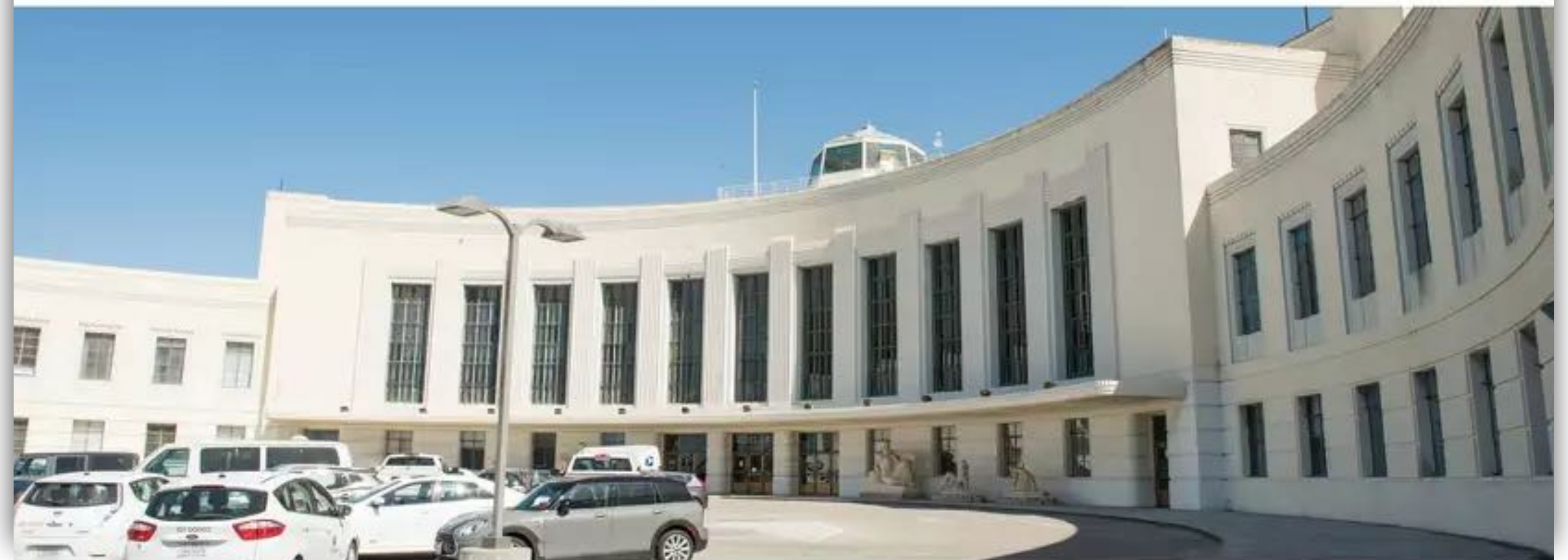
Treasure Island Building One stands in for the Berlin Airport circa 1938 in Indiana Jones and the Last Crusade