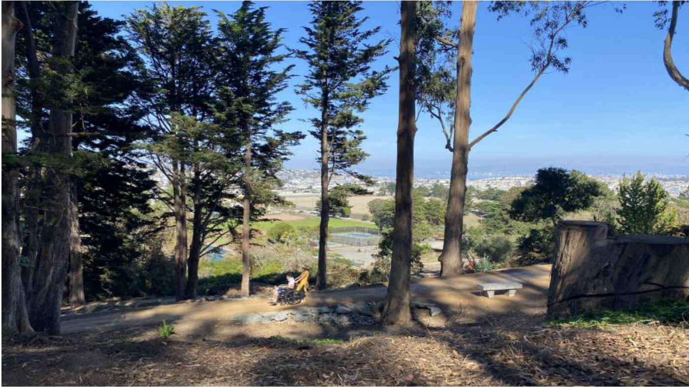
McLaren Trails – In Construction

The last active project is McLaren Trails, funded by three Citywide Parks and Programs: McLaren Park, Trails Program, and Urban Forestry program. It is currently in construction, with some trail segments now complete and open to the public; full project completion is anticipated March 2026.