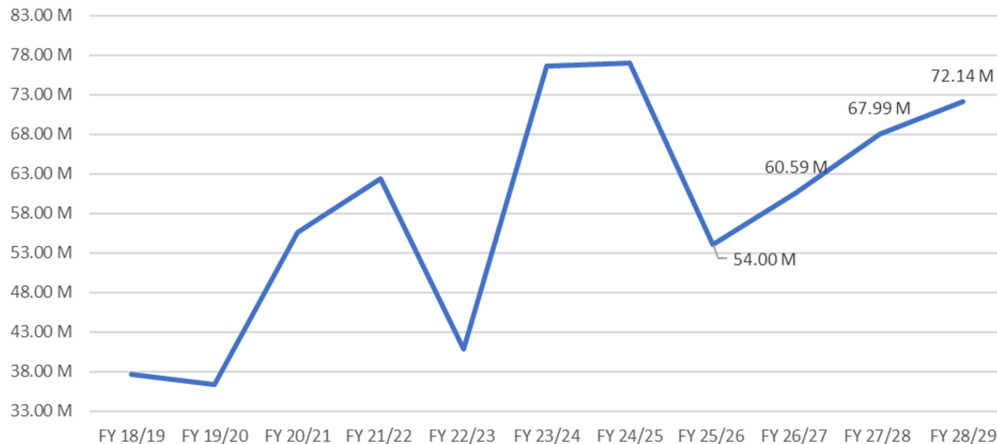
BHSA(MHSA) Revenue Trend/ Projections

*Summary includes State distributions only, excluding interest and reallocations of reverted funding from other counties